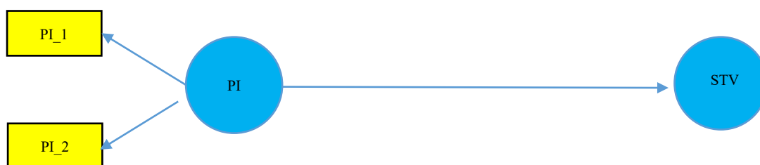
Figure 1. Form of structural equation of party ID and STV

This dual approach allows for a more comprehensive and in-depth mapping of the levels and characteristics of STV as well as a more comprehensive and in-depth causal examination of the party-ID influence.